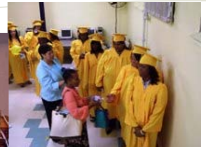
June 2009 WEI GED Graduates