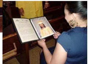
A Glimpse of the Future!