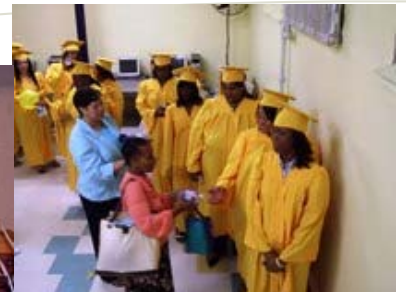
June 2009 WEI GED Graduates